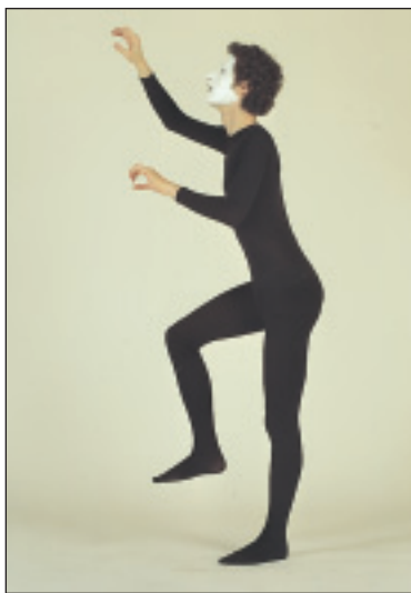
A talented mime can make you believe he is actually doing what he is only pretending to do.