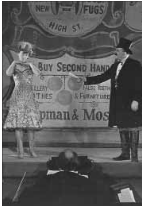
Vaudeville shows, which entertained large audiences with musical numbers and comedy sketches, were among the first steps in the development of the great American musicals.

Audiences loved musical theatre. Star performers such as George M. Cohan and composers such as