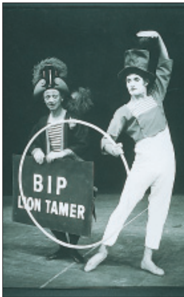
The most famous mime in the world is probably Marcel Marceau.